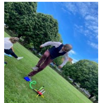
Stomp Rockets at HDmedical's "Fun Day Out" in Burlington, VT